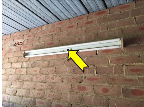
Photo 2. Interior, double tube fluorescent light fitting – suspected non PCB-containing capacitor.