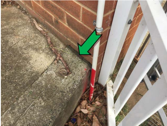
Photo 1. Exterior, southern wall, expansion joint – non asbestos-containing construction mastic.